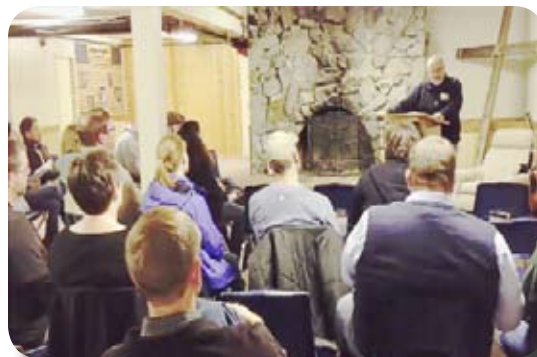
Vancouver Church Planter Family Retreat

Blue River-Kansas City Baptist Association 4041 NE Lakewood Way, Suite 260 Lee's Summit, MO 64064 816-795-1822