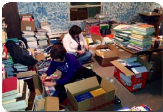
Horn of Africa books being processed at Bethel Baptist